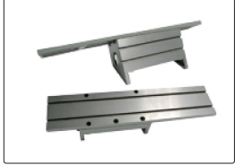
tilted fixed frame (optional)