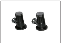
plane caps (included)