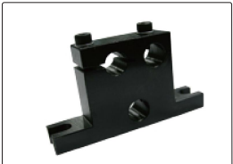
indicator gauge stand (optional)