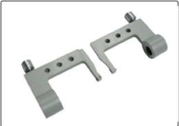
large measuring hook (included)