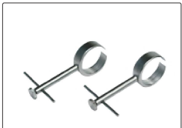
3-wires bracket (included)