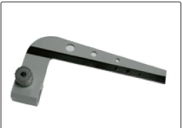
universal hook (optional)