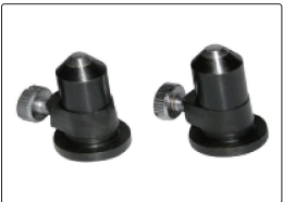
spherical caps (included)