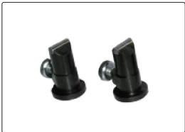
blade shape caps (included)