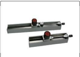
measuring block grinding frames (included)