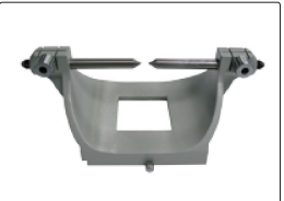
horizontal ejector pin bracket (included)