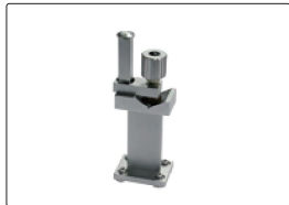
single V-stand (included)