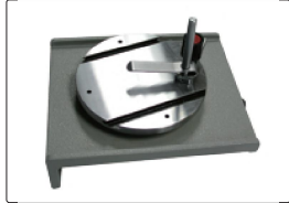
round floating table (included)