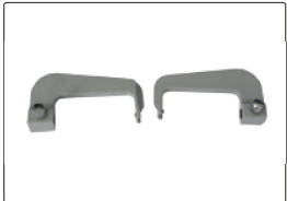
small measuring hook (included)