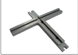
cruciform frame (optional)