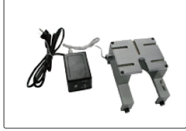
electronic measuring device (included)